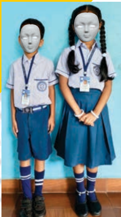
CLASS I & II GIRLS & BOYS