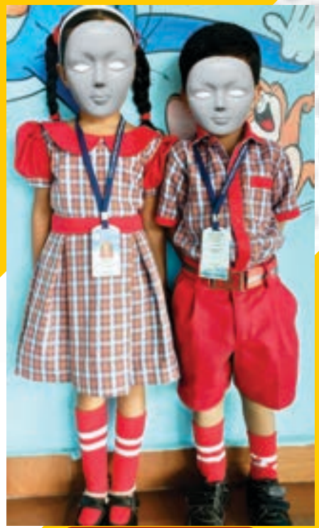
KG GIRLS & BOYS