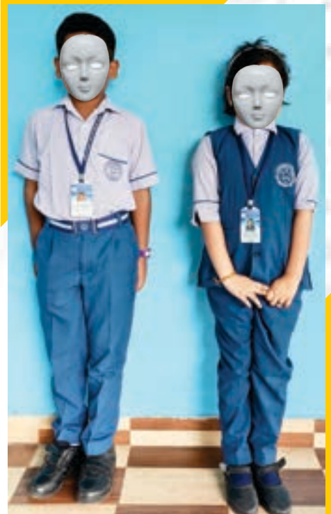
CLASS III & XII GIRLS & BOYS