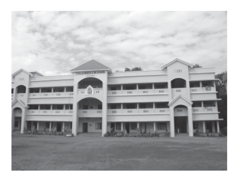
"You are an important brick in the wall." Anon